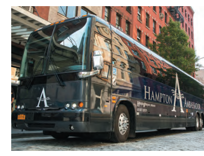
www.hamptonjitney.com • www.hamptonambassador.com facebook.com/hamptonjitney twitter.com/hamptonjitney instagram.com/hamptonjitney

Hampton Jitney offers private charter and receptive tour services as well as packaged tours. We service the entire Northeast. Tours range from same-day round-trips to multi-day, over-the-road excursions. We provide tour planning and receptive services for any size group and specialize in tours on the East End of Long Island. For more information, please contact Hampton Jitney or visit us on the web at www.hamptonjitney.com.